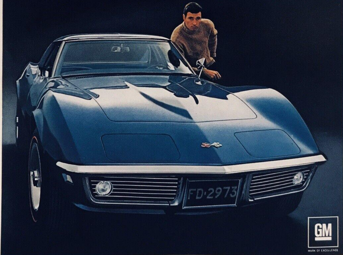
Corvette Sting Ray Coupe, Sports Class winner of Motor Trend's 1968 Achievement Award